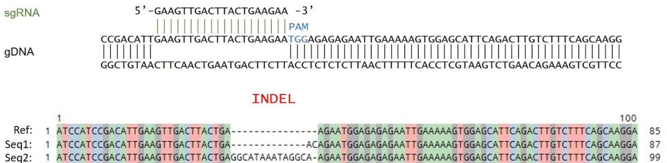
Figure 1: Genomic Sequencing of B2M in the B2M Knockout NFAT Luciferase Reporter Jurkat Cell Line. Genomic DNA from the B2M Knockout NFAT Luciferase Reporter Jurkat cells were isolated and sequenced. The PAM (Protospacer Adjacent Motif) is shown in blue, the sgRNA (synthetic guide RNA) and the Indels (Insertions/Deletions) in the two TRAC alleles are labeled, B2M genomic DNA labeled as Ref.