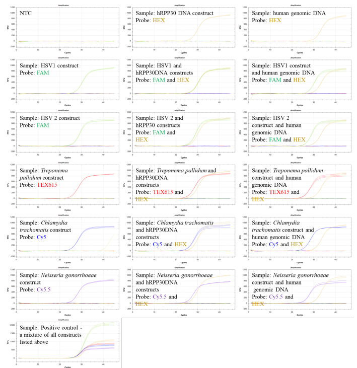
Figure 1: Verification experiments with single and multiple targets (given in text boxes for each panel). All sets of probes and primers are present in every reaction, but positive signal is only observed when the target(s) is present, indicating that the amplification is specific.