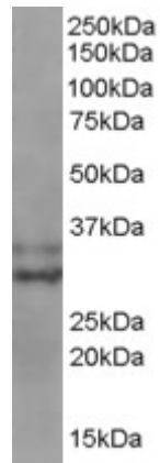
EB05088 staining (0.3 \mu g/ml) of MOLT4 lysate (35 \mu g protein in RIPA buffer). Primary incubation was 1 hour. Detected by chemiluminescence.