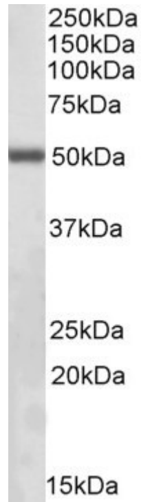
EB05120 (0.5 \mu g/ml) staining of NIH3T3 lysate (35 \mu g protein in RIPA buffer). Primary incubation was 1 hour. Detected by chemiluminescence.