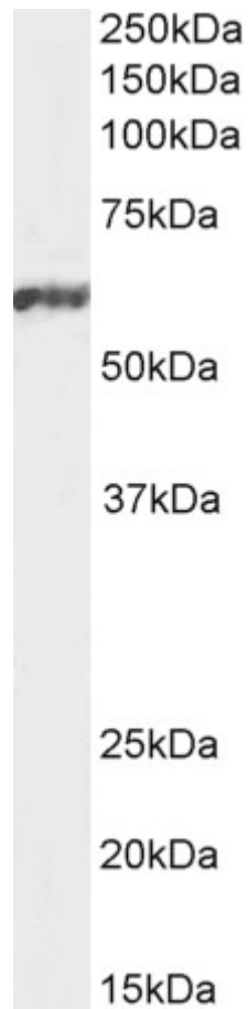
EB05227 staining (1 \mu g/ml) of Jurkat nuclear cell lysate (RIPA buffer, 20 \mu g total protein per lane). Detected using chemiluminescence.