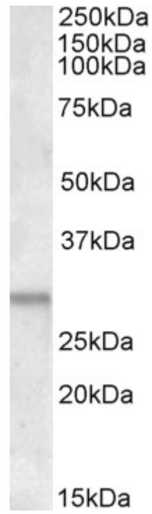
EB05246 (1.5 \mu g/ml) staining of Human Heart lysate (35 \mu g protein in RIPA buffer). Primary incubation was 1 hour. Detected by chemiluminescence.