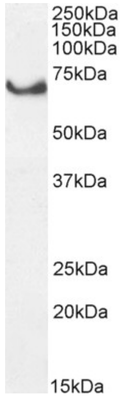
EB05285 (1 \mu g/ml) staining of U937 cell lysate (35 \mu g protein in RIPA buffer). Detected by chemiluminescence.