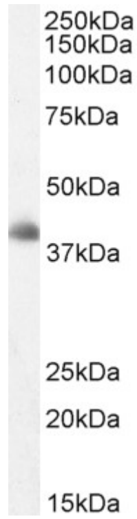
EB05361 staining (2 \mu g/ml) of Human Cerebellum lysate (RIPA buffer, 35 \mu g total protein per lane). Detected by chemiluminescence.