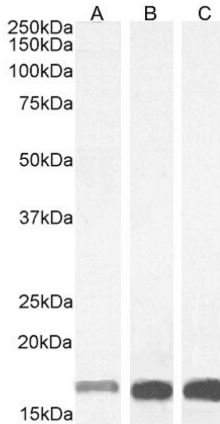
EB05419 (1 \mu g/ml) staining of Human Frontal Cortex (A) Mouse Brain (B) and Rat Brain (C) lysate (35 \mu g protein in RIPA buffer). Detected by chemiluminescence.