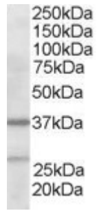
EB05435 staining (2 \mu g/ml) of Human Liver lysate (RIPA buffer, 35 \mu g total protein per lane). Primary incubated for 1 hour. Detected by chemiluminescence.