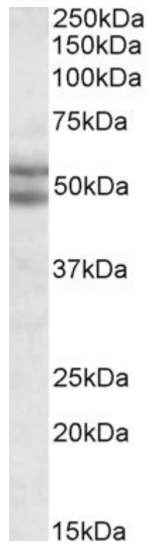
EB05487 (2 \mu g/ml) staining of nuclear HeLa lysate (35 \mu g protein in RIPA buffer). Primary incubation was 1 hour. Detected by chemiluminescence.