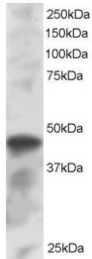
EB05586 staining (1 \mu g/ml) of K562 lysate (RIPA buffer, 30 \mu g total protein per lane). Primary incubated for 1 hour. Detected by western blot using chemiluminescence.