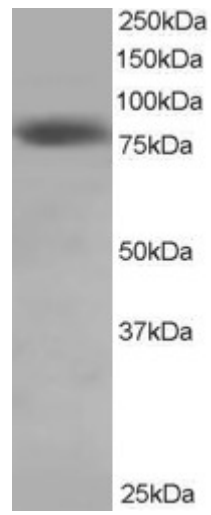
EB05610 staining (0.5 \mu g/ml) of HeLa lysate (RIPA buffer, 35 \mu g total protein per lane). Primary incubated for 1 hour. Detected by chemiluminescence.