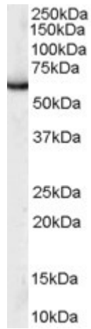
EB05683 (0.1µg/ml) staining of HEK293 lysate (35µg protein in RIPA buffer). Detected by chemiluminescence.