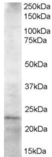
EB05750 staining (1.5 \mu g/ml) of Jurkat lysate (RIPA buffer, 35 \mu g total protein per lane). Primary incubated for 1 hour. Detected by western blot using chemiluminescence.