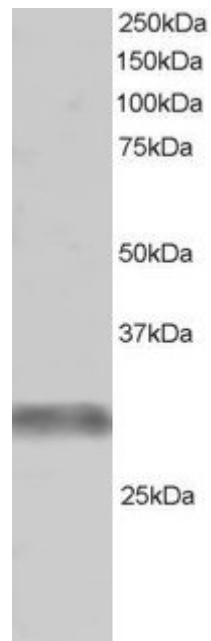
EB05937 (1 \mu g/ml) staining of Human Skeletal Muscle lysate (RIPA buffer, 30 \mu g total protein per lane). Primary incubated for 1 hour. Detected by western blot using chemiluminescence.