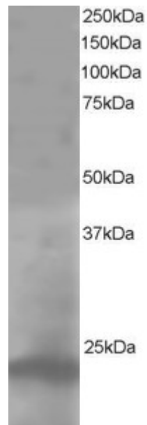
EB05946 staining (1 \mu g/ml) of A431 lysate (RIPA buffer, 35 \mu g total protein per lane). Primary incubated for 1 hour. Detected by western blot using chemiluminescence.