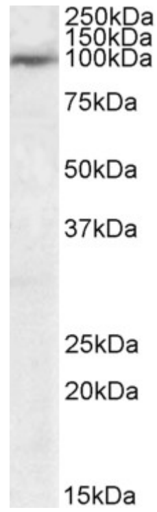
EB05997 (1 \mu g/ml) staining of Human Tonsil lysate (35 \mu g protein in RIPA buffer). Primary incubation was 1 hour. Detected by chemiluminescence.