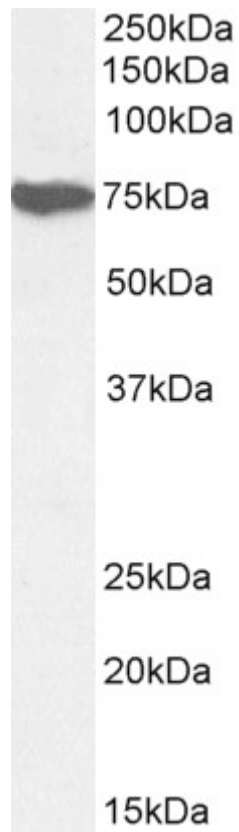
EB06140 (0.3 \mu g/ml) staining of Human Cerebellum lysate (35 \mu g protein in RIPA buffer). Detected by chemiluminescence.