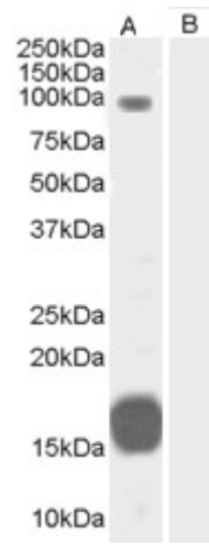
EB06142 (0.3µg/ml) staining of Human Heart lysate (35µg protein in RIPA buffer) with (B) and without (A) blocking with the immunising peptide. Primary incubation was 1 hour. Detected by chemiluminescence.