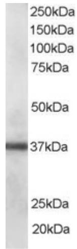
EB06229 staining (0.1 \mu g/ml) of Human Lung lysate (RIPA buffer, 35 \mu g total protein per lane). Primary incubated for 1 hour. Detected by chemiluminescence.