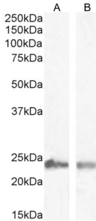
EB06281 (0.03 \mu g/ml) staining of Human Skeletal muscle (A) and (0.003 \mu g/ml) Testes (B) lysate (35 \mu g protein in RIPA buffer). Detected by chemiluminescence.