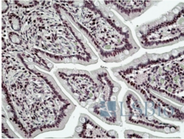
EB06353 (3.75µg/ml) staining of paraffin embedded Human Small Intestine. Steamed antigen retrieval with citrate buffer pH 6, AP-staining.