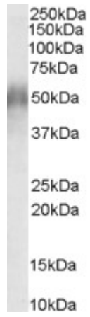
EB06414 (0.3 \mu g/ml) staining of Human Thymus lysate (35 \mu g protein in RIPA buffer). Primary incubation was 1 hour. Detected by chemiluminescence.