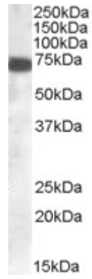
EB06640 (0.1 \mu g/ml) staining of Human Cerebellum lysate (35 \mu g protein in RIPA buffer). Primary incubation was 1 hour. Detected by chemiluminescence.