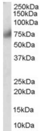
EB06649 (0.3 \mu g/ml) staining of Human Breast lysate (35 \mu g protein in RIPA buffer). Primary incubation was 1 hour. Detected by chemiluminescence.