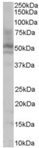
EB06700 (0.1 \mu g/ml) staining of HepG2 lysate (35 \mu g protein in RIPA buffer). Detected by chemiluminescence.