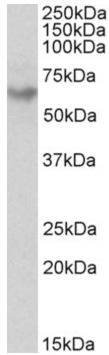
EB06730 (0.5 \mu g/ml) staining of Human Brain (Hippocampus) lysate (35 \mu g protein in RIPA buffer). Detected by chemiluminescence.