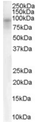
EB06750 (0.1 \mu g/ml) staining of Human Bone Marrow lysate (35 \mu g protein in RIPA buffer). Primary incubation was 1 hour. Detected by chemiluminescence.