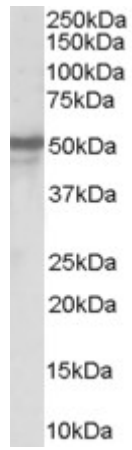
EB06769 (0.3 \mu g/ml) staining of Human Brain lysate (35 \mu g protein in RIPA buffer). Detected by chemiluminescence.