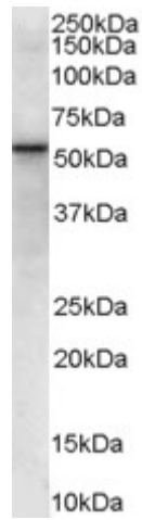
EB06832 (0.03 \mu g/ml) staining of Human Placenta lysate (35 \mu g protein in RIPA buffer). Primary incubation was 1 hour. Detected by chemiluminescence.