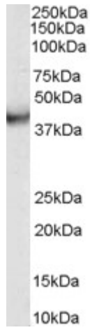
EB06833 (0.03g/ml) staining of human duodenum lysate (35 \mu g protein in RIPA buffer). Primary incubation was 1 hour. Detected by chemiluminescence.