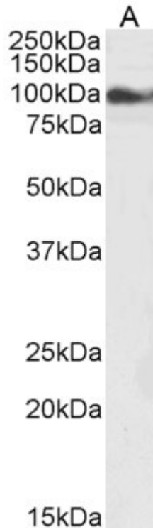
EB06901 (1 \mu g/ml) staining of A549 cell lysate (35 \mu g protein in RIPA buffer). Detected by chemiluminescence.