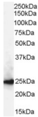
EB06958 (0.3 \mu g/ml) staining of A431 lysate (35 \mu g protein in RIPA buffer). Primary incubation was 1 hour. Detected by chemiluminescence.