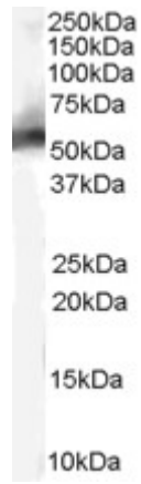
EB06990 (0.3µg/ml) staining of Human Liver lysate (35µg protein in RIPA buffer). Primary incubation was 1 hour. Detected by chemiluminescence.