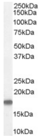
EB07115 (1 \mu g/ml) staining of Human Testis Lysate (35 \mu g protein in RIPA buffer). Primary incubation was 1 hour. Detected by chemiluminescence.