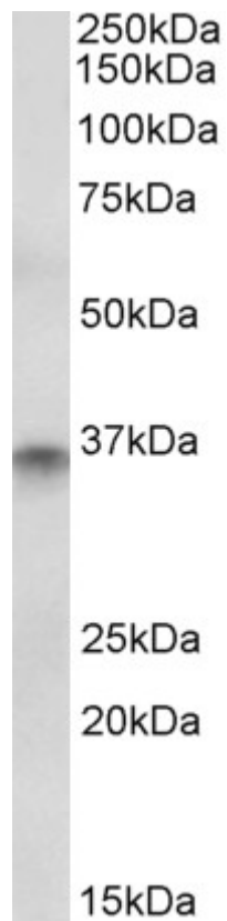
EB07190 (1µg/ml) staining of Human Colon lysate (35µg protein in RIPA buffer). Detected by chemiluminescence.