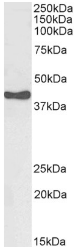
EB07218 (0.003 \mu g/ml) staining of Human Adrenal Gland lysate (35 \mu g protein in RIPA buffer). Primary incubation was 1 hour. Detected by chemiluminescence.