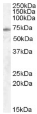
EB07225 (0.5 \mu g/ml) staining of Human Lung lysate (35 \mu g protein in RIPA buffer). Primary incubation was 1 hour. Detected by chemiluminescence.