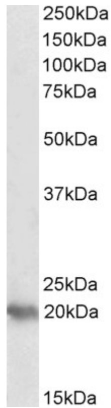
EB07234 (1 \mu g/ml) staining of Human Liver lysate (35 \mu g protein in RIPA buffer). Primary incubation was 1 hour. Detected by chemiluminescence.