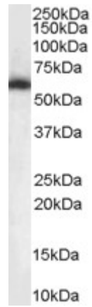
EB07246 (0.1µg/ml) staining of Mouse Brain lysate (35µg protein in RIPA buffer). Primary incubation was 1 hour. Detected by chemiluminescence.