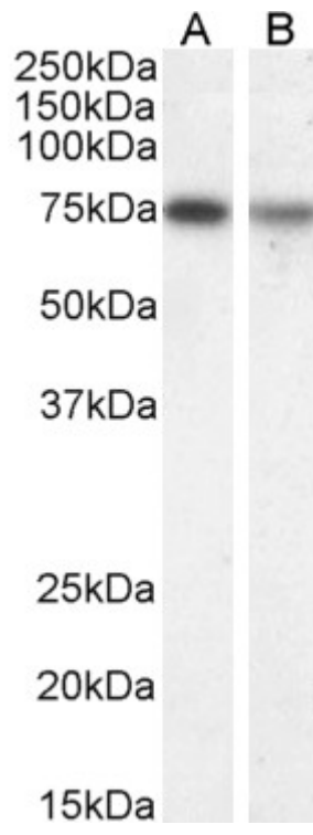
EB07255 (1 \mu g/ml) staining of Mouse (A) and Rat (B) Brain lysate (35 \mu g protein in RIPA buffer). Detected by chemiluminescence.