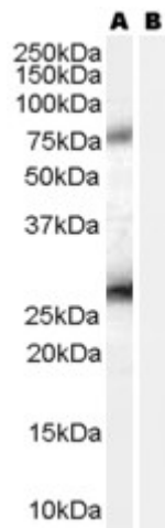
EB07292 (0.2 \mu g/ml) staining of A431 lysate (35 \mu g protein in RIPA buffer) with (B) and without (A) blocking with the immunising peptide. Primary incubation was 1 hour. Detected by chemiluminescence.