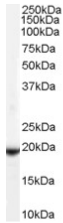
EB07316 (0.1 \mu g/ml) staining of Human Testis lysate (35 \mu g protein in RIPA buffer). Primary incubation was 1 hour. Detected by chemiluminescence.