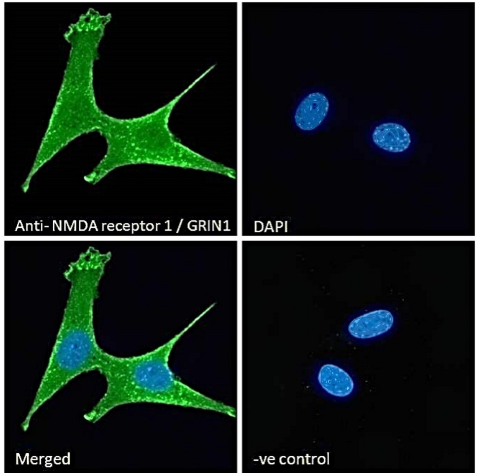
EB07341 Immunofluorescence analysis of paraformaldehyde fixed NIH3T3 cells, permeabilized with 0.15% Triton. Primary incubation 1hr (10ug/ml) followed by Alexa Fluor 488 secondary antibody (2ug/ml), showing plasma membrane and cytoplasmic staining. The nuclear stain is DAPI (blue). Negative control: Unimmunized goat IgG (10ug/ml) followed by Alexa Fluor 488 secondary antibody (2ug/ml).