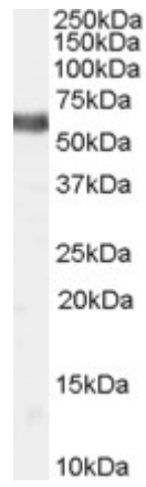
EB07404 (2 \mu g/ml) staining of Human Thyroid lysate (35 \mu g protein in RIPA buffer). Detected by chemiluminescence.