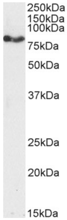
EB07419 (2 \mu g/ml) staining of MCF7 cell lysate (35 \mu g protein in RIPA buffer). Detected by chemiluminescence.