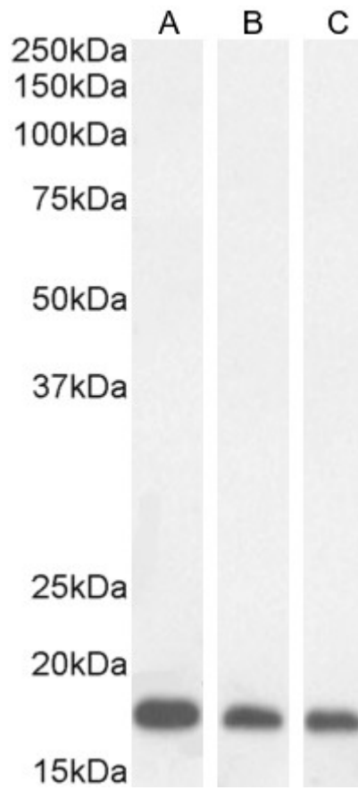
EB07557 (1 \mu g/ml) staining of A431 (A) and (0.3 \mu g/ml) of HeLa (B) and MCF7 (C) cell lysate (35 \mu g protein in RIPA buffer). Detected by chemiluminescence.