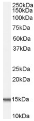
EB07583 (0.01 \mu g/ml) staining of Human Testis lysate (35 \mu g protein in RIPA buffer). Detected by chemiluminescence.