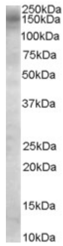
EB07591 (0.1 \mu g/ml) staining of Daudi cell lysate (35 \mu g protein in RIPA buffer). Primary incubation was 1 hour. Detected by chemiluminescence.